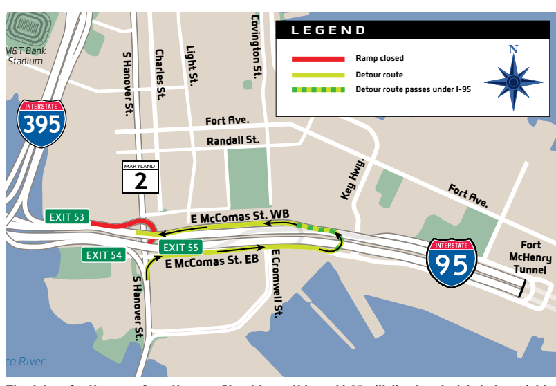
The detour for the ramp from Hanover Street to southbound I-95 will direct motorists to turn right onto E. McComas Street, to E. McComas Street on-ramp to southbound I-95.

Weather permitting, the Maryland Transportation Authority (MDTA) will temporarily close the ramp from southbound I-95 to southbound MD 295 (Exit 52) on Friday, October 21, at 10 p.m. to 8 a.m. Sunday, October 23, and Friday, October 28, at 10 p.m. to 5 a.m. Monday, October 31. In addition, when the ramp from southbound I-95 to southbound MD 295 is closed, the ramp from Hanover Street to southbound I-95 must also be closed during the same time frame.