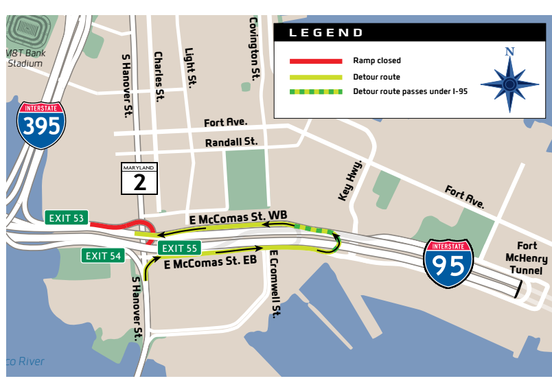
The detour for the ramp from Hanover Street to southbound I-95 will direct motorists to turn right onto E. McComas Street, to E. McComas Street on-ramp to southbound I-95.

Weather permitting, the Maryland Transportation Authority (MDTA) will temporarily close the ramp from southbound I-95 to southbound MD 295 (Exit 52) on Friday, October 7, at 10 p.m. to 3:30 p.m. Sunday, October 9, and Friday, October 14, at 10 p.m. to 5 a.m. Monday, October 17. In addition, when the ramp from southbound I-95 to southbound MD 295 is closed, the ramp from Hanover Street to southbound I-95 must also be closed during the same time frame.