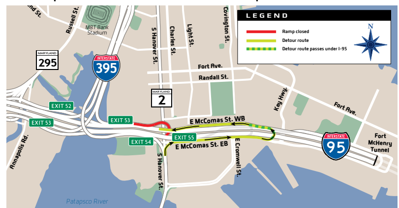
Detour map for Hanover Street to southbound I-95 Ramp Closure