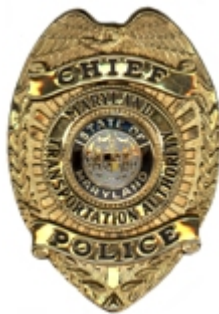
Chief, Maryland Transportation Authority Police

Employ, Train, Equip, and Develop a Model Workforce that is Diverse, Healthy, and Mindful