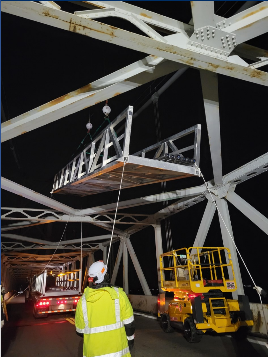
Installing Gator Dock to support utilities