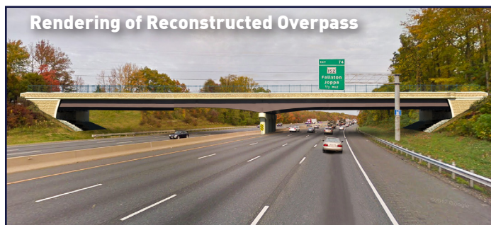
Rendering of Reconstructed Overpass