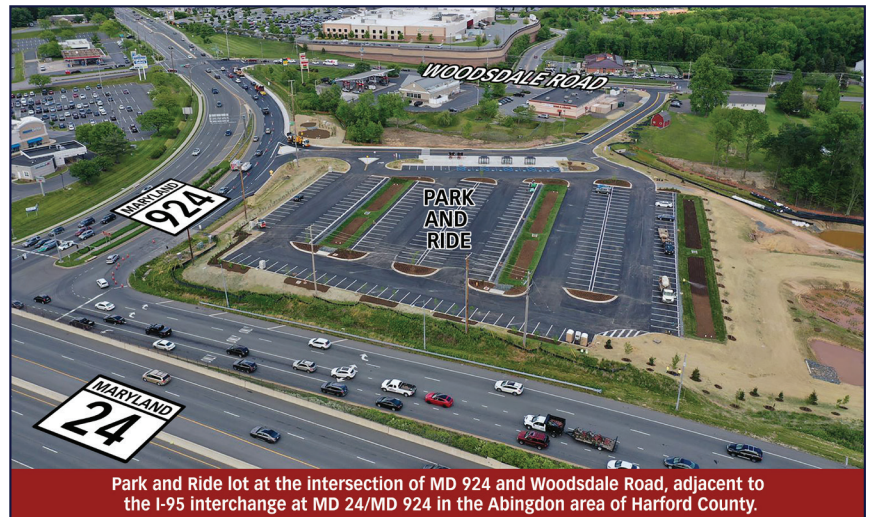
Park and Ride lot at the intersection of MD 924 and Woodsdale Road, adjacent to the I-95 interchange at MD 24/MD 924 in the Abingdon area of Harford County.

For MD 24 Southbound Traffic, take the exit for MD 924/ Emmorton Road/Tollgate Road to the signal and make a left turn onto MD 924/Emmorton Road. Stay right and go straight through the next signal. The entrance to the Park and Ride is on your right just past the signal. This is a right-in and right-out access. Full access to the Park and Ride is provided from Woodsdale Road.