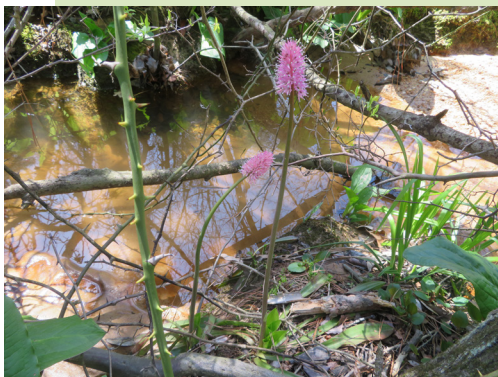
Swamp Pink, an endangered species, can be found within the project limits.