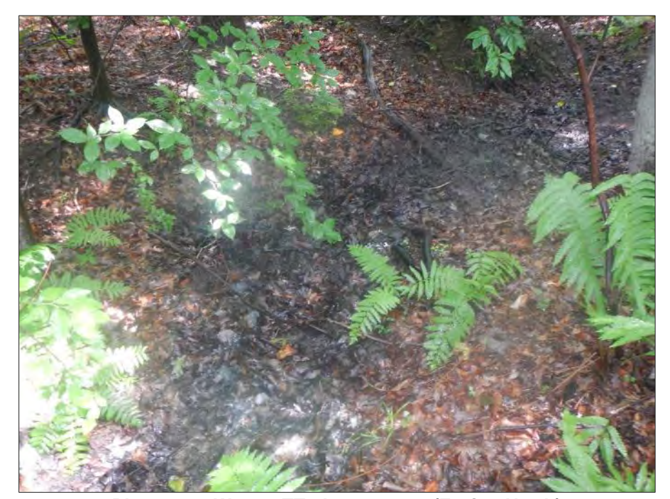
Photo108: Waters TT, downstream (Facing North)